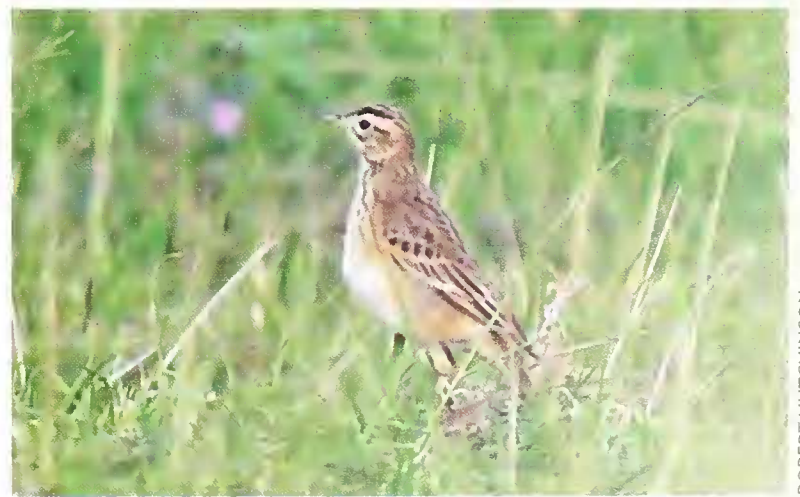
Plate 16. Richard's Pipit Anthus richardi , Basco airfield, Batan Island, Batanes, 15 October 2013.